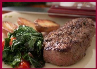
RIBEYE AND SAVORY TRI TIP