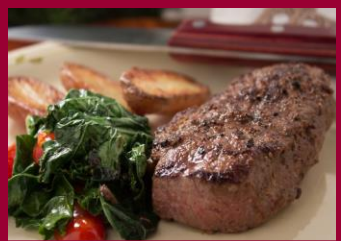
RIBEYE AND SAVORY TRI TIP